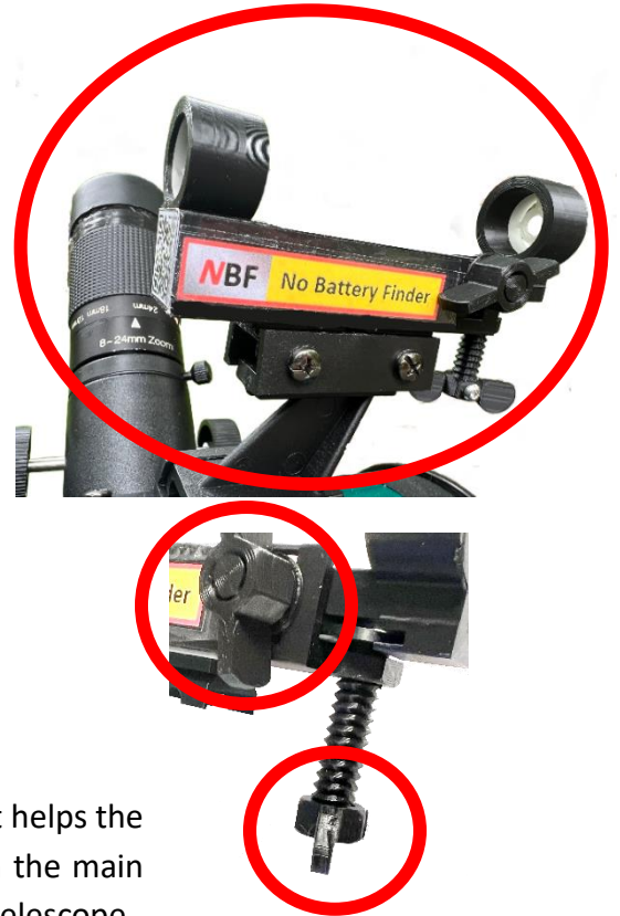
NBF's adjustment knobs

The No Battery Finder (NBF) is an eco-friendly alternative to the classic Red Dot Finder (RDF) . NBF uses the same mounting as the classic RDF and does not require batteries making it more friendly to our environment and one less maintenance issue for libraries. NBF's adjustment knobs allow the finder to be aligned to match the view in the telescope. The white crosshairs built into the NBF are typically visible without illumination, especially in urban skies. If not visible, the crosshairs can be illuminated with the red light of a headlamp. The crosshairs are made of “glow-in-the-dark” filament and can be temporarily illuminated through exposure to a bright light.